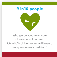
LONG TERM CARE How long will you pay?